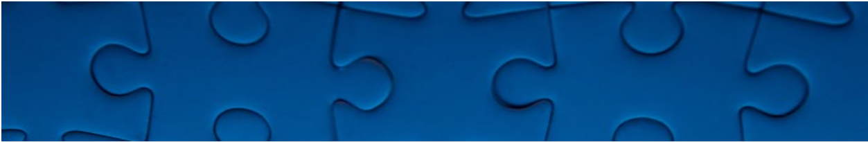
FIGURE 1. OVERALL ARCHITECTURE OF THE CORE COMPETENCIES FRAMEWORK